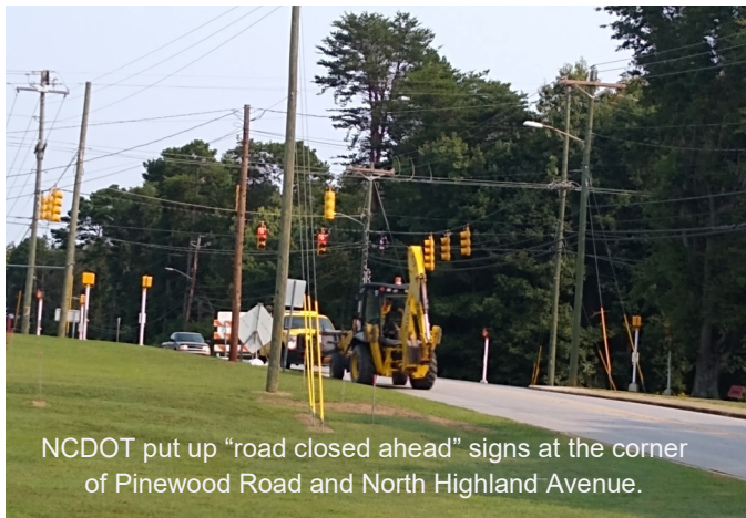
NCDOT put up "road closed ahead" signs at the corner of Pinewood Road and North Highland Avenue.