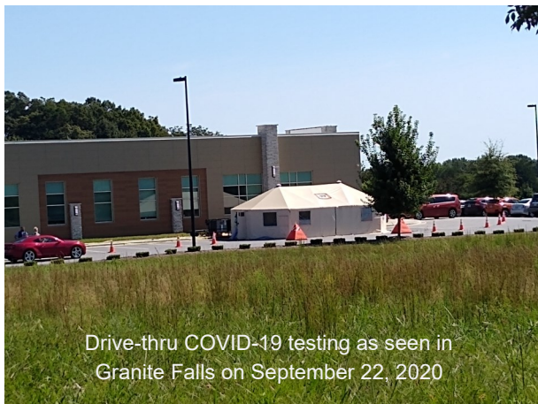
Drive-thru COVID-19 testing as seen in Granite Falls on September 22, 2020

Schools: Dudley Shoals Elementary School suspended in-person learning and went remote the week after the Labor Day Holiday (September 7th - September 10th) due to absences from COVID-19. They resumed normal classes on September 13th. The school system also cancelled high school football games scheduled for August 20 due to the virus.